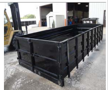
0482 - 18' X 40" side & front With 2 piece rear doors $1495.00