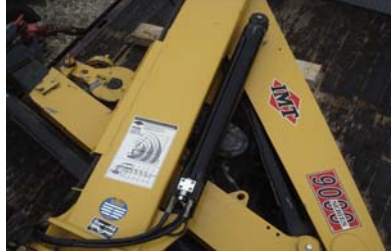
0437 - IMT 9000 series Knuckle boom Crane 3050# @ 25' 11" Reach, 2-hyd & winch $3500.00