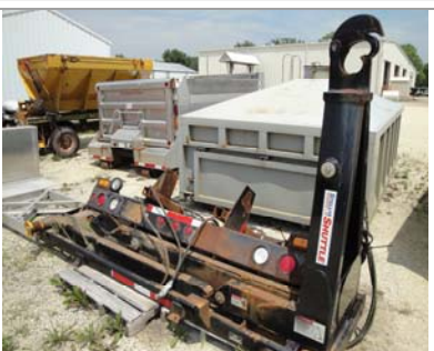
0461 - Stellar 96-10-24 Hook lift Alum. Headachy rack, 54" hook height, 24,000# cap. $6000.00