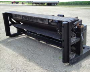
0455 - Maxon 72-25RO 2500# Tuck Under Lift Gate Hyd. Power unit $1000.00