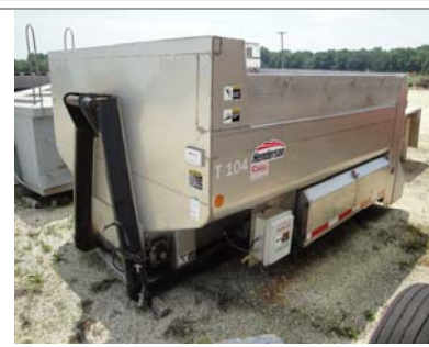
0462 - 11' Henderson Muni Body- Prewet Kit, Sander, 409 Stainless Steel $8000.00