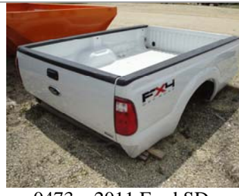
0473 - 2011 Ford SD Fit 3/4 or 1 ton New Take off $1200.00