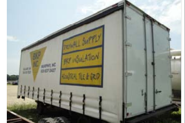
0476 - Curtain Side Van Body 2007 Brown mfg. 24' x 102" W x 104" H 2 rear doors $4950.00