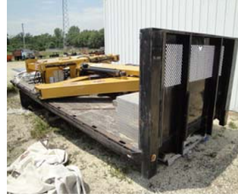
0435 - Omaha Std 20' x 96" wood deck, 3/8" x 2" strap on side rail $1000.00