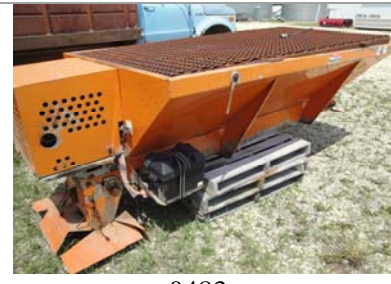
0483 8' Henderson 409 Stainless Steel Self contained power unit. $2760.00