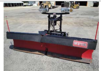
0480 - 8 1/2' MVP Western V-Plow, Snow Deflector hand held controls, 2 year old with New mount for Any Truck $3800.00