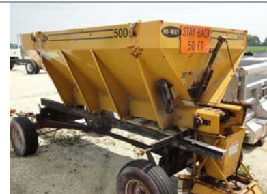
0434 - 10' Salt & Sand Spreader Slide In Style for dump truck $1500.00