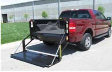
0437 - New Eagle Lift gate For GM 2007 + E38-58, Cable liftgate, Smooth Steel Platform $1425.00