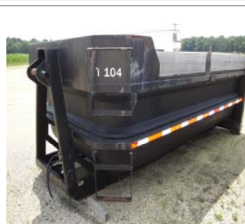
0463 - 14' Plastic Dump body Snow Removal body $3000.00