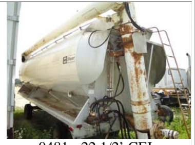
0481 - 22 1/2' CEI Bulk Feed body 5 compartments 24' Unload Auger $2500.00