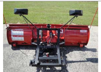
0471 - Western Snow Plow 7 1/2' Uni-Mount STD 88-98, 1/2 ton GM $2000.00