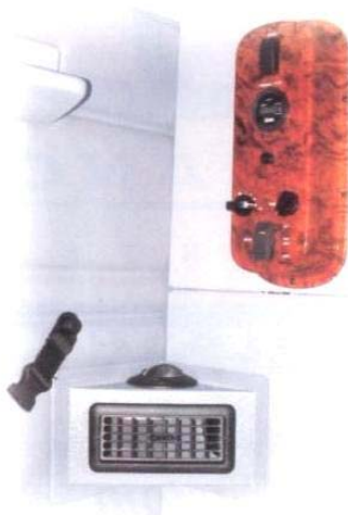
Air Distribution Ducts Blend with Interior