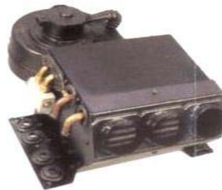
APU Evaporator Specifications: